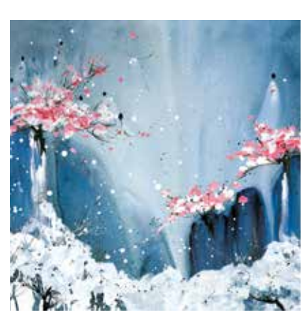
DANIELLE O'CONNOR AKIYAMA