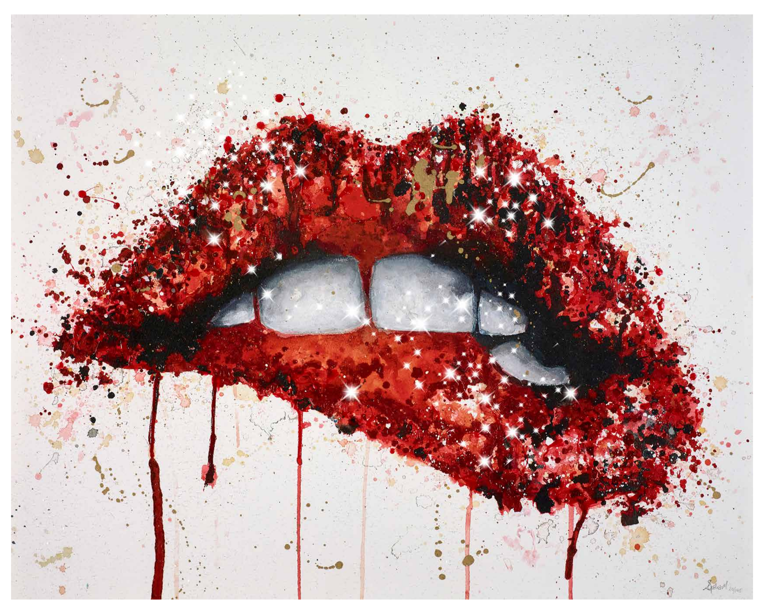
Read My Lips Paper Edition of 195 Artwork Size: 24 x 19" £650