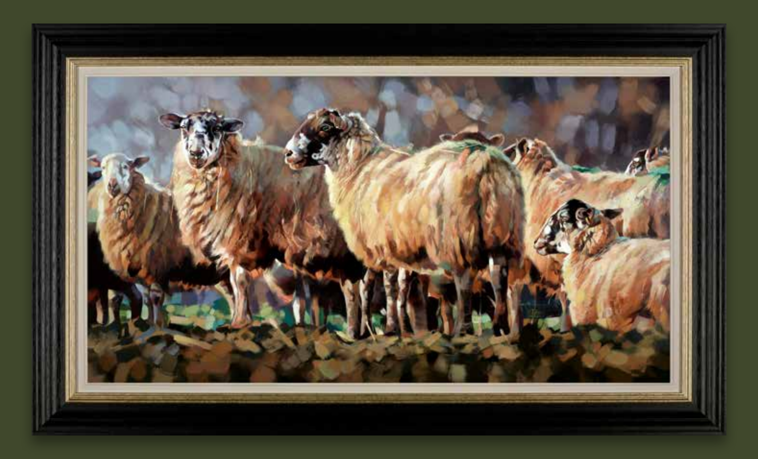
Evening Flock Canvas on Board Edition of 95 Artwork Size: 42 x 22" £650