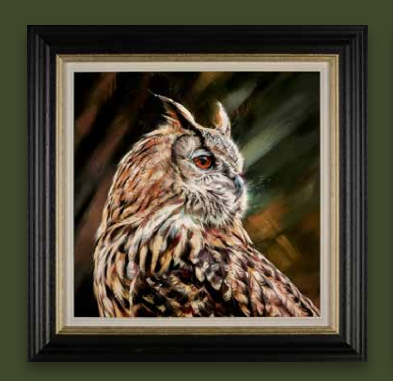
The Scholar Canvas on Board Edition of 95 Artwork Size: 20 x 20" £375