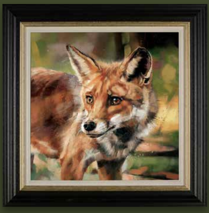
The Strategist Canvas on Board Edition of 95 Artwork Size: 20 x 20" £375