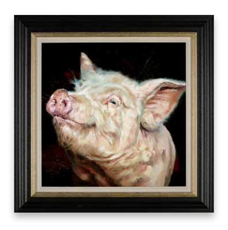
Happy Days Canvas on Board Edition of 95 Artwork Size: 20 x 20" £375

WITH AN UNERRING HAND AND EYE FOR THE DETAILS OF THE NATURAL WORLD, DEBBIE BOON RANGES ACROSS FOREST AND FIELD, WOODLAND AND FARMYARD IN HER OWN INIMITABLE STYLE. THIS MAJOR NEW COLLECTION OF HAND SIGNED EDITIONS CAPTURES MOMENTS OF STILLNESS OR MOTION, DRAMA OR HUMOUR WITH EXTREME ACCURACY AND A CHARMING LIGHTNESS OF TOUCH.