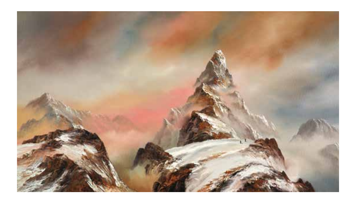
Scaling New Heights Canvas Board Edition of 195 Artwork Size: 32 x 18" £695

PHILIP'S BREATH-TAKING NEW COLLECTABLE EDITIONS EMBRACE THE SPIRIT OF ADVENTURE AS WE JOURNEY ALONG TRANQUIL SHORES TO AWE-INSPIRING MOUNTAIN PEAKS. DIVING DEEP OR SOARING HIGH, THESE NEW WORKS PERFECTLY ENCAPSULATE THE ESSENCE OF HIS 'EXTREME ART'.